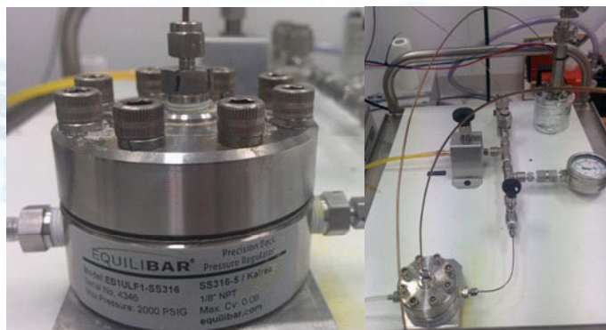
Figure 3: Equilibar EB1ULF1 installed in ANU research application

Researchers were able to achieve their desired pressure control using the Equilibar® ULF. Because the metallic diaphragm chosen for this application did have a low leak rate between the diaphragm and orifice, a needle valve was installed in line