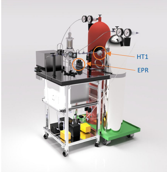
Figure 1: CAD Drawing of the supercritical CO 2 plasma reactor using an Equilibar HT1 with an EPR3000 pilot regulator for pressure control

The Equilibar BPR is a dome-loaded pressure regulator with pilot operation. This means that gas or air is fed into the top (dome) area of the regulator to provide the pressure setpoint for the process. The pressure of the gas in the dome is set by a secondary pressure regulator called a pilot regulator. In this case, an EPR3000 was used as the pilot regulator for automated control.