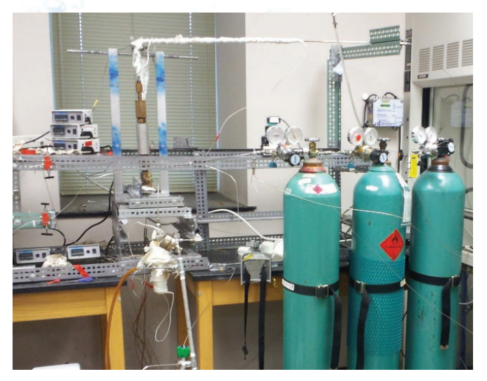
Lab set-up showing Fischer Tropsch Synthesis reactor (forground, insulated) with flow control instrumentation

Catalyst researchers often rely on back pressure regulators to maintain stable reaction pressures under the extreme reaction conditions. At Auburn, Roe's application requires the process to run at both high pressures (1000 psig) and high temperatures (up to 350°C). Originally, Roe used traditional manual back pressure regulators in his experiments, resulting in pressure deviations of approximately 30 psi. Traditional regulators are springoperated and open as overpressure compresses the spring. The change in the spring constant as the spring is compressed is a major source of error, or overpressure, in traditional designs. In addition, the spring-operated regulators have limited pressure range and high hysteresis.