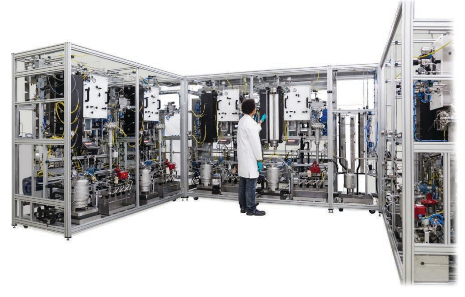
Figure 1: Refinery catalyst test unit by ILS - Integrated Lab Solutions, GmbH

The valve action is not provided by the movement of a tapered stem, but by the close proximity of the diaphragm and the orifice plate. The supple diaphragm can vary its proximity to the orifice nearly instantaneously to adjust to the varying valve coefficient requirements of the various phases. A further benefit is provided by the unique multiple orifice design. Even if one orifice is totally flooded by the denser liquid, volumetric flow control can still be maintained so long as some of the orifices are still predominantly in the gas phase.