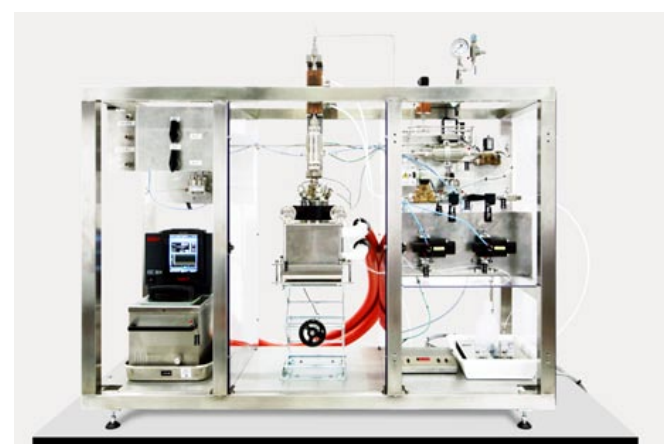
Figure 2: Hydrofluoric Acid research system built by Integrated Lab Solutions with the installation of the Equilibar® regulator.

Nagy noted that an additional advantage of the system is that the C4-Hastalloy valve could be custom fabricated in a shorter time frame than other valves. Most acidic and corrosive applications can be satisfied by Hastelloy C276, which Equilibar keeps in stock to meet customer demands.