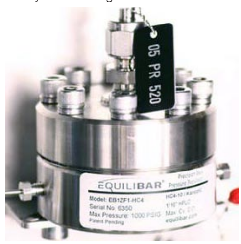
Figure 3: The hydrofluoric acid back pressure regulator used in the ILS research system

According to Nagy, the benefits of the system are notable: "The extremely broad turndown of the Equilibar means that the ILS client has virtually unlimited flow and pressure-variation flexibility over the ranges of interest for these studies."